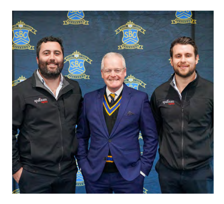
Celebrating Progress and Community at St Bernard's College.

As I reflect on the first two terms of 2024, I am filled with a profound sense of pride and accomplishment. This year marks a significant milestone for our entire College community, with many of our long-term plans coming to fruition, unprecedented student engagement, and strengthened connections with old collegians and community groups.